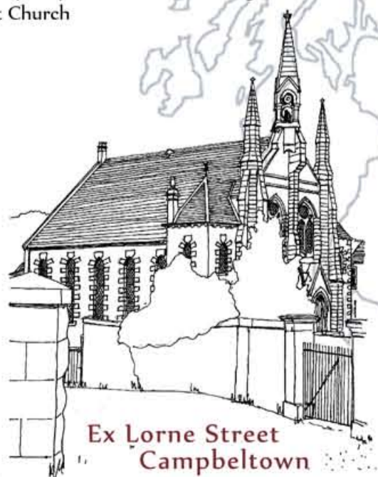
Ex Lorne Street Campbeltown

Hebron Evangelical Church, Aberdeen (formerly Denburn Parish Church) Brucefield Parish Church, Whitburn West Kilbride Parish Church Dunoon High Kirk Acharacle Parish Church Condorrat Parish Church St Andrew's Parish Church, Fauldhouse Lanark E U Congregational Church St George's Parish Church, Dumfries St Andrew & St Cuthbert, Kirkcudbright St Andrew's Episcopal Church, Ardrossan The Priory Church, Coldingham Coldside Parish Church, Dundee St Margaret's Parish Church, Dalry Girvan North Parish Church Newhills Parish Church, Bucksburn, Aberdeen Kilninian Church, Mull Limekilns Parish Church Bothwell Parish Church City Church Dundee (St Francis Friary) Torosay and Kinlochspelve Church, Craignure Edinburgh Life Church Christ Church Episcopal, Huntly Viewfield Erskine Church, Stirling Denholm Parish Church Crosshouse Parish Church Dalziel St Andrew's Parish Church, Motherwell Sannox Church, Trinity Church, Banff Fetteresso Parish Church St Mary's Episcopal Cathedral, Edinburgh Muckhart Church